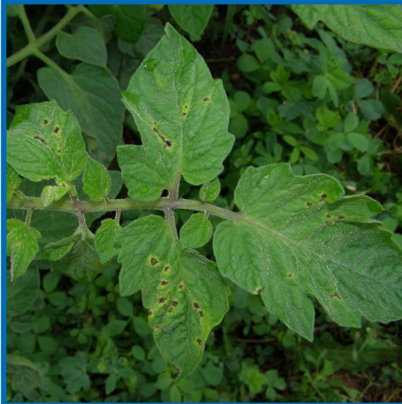
On tomato leaves, bacterial spot leads to small, angular (i.e., straight-edged) spots with yellow haloes.

pathogens are not human pathogens, the fruit blemishes that they cause can provide entry points for human pathogens that could cause illness.